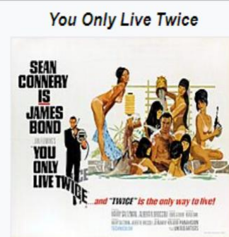
Theatrical release poster by Robert McGinnis and Frank McCarthy